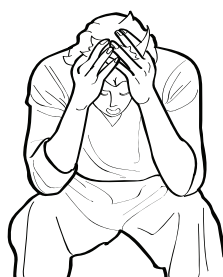
Kugira umunaniro ukabije