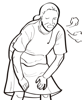
Guhera umwuka cyangwa kwitsa nabi