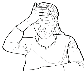
Guhinda umuriro mwinshi