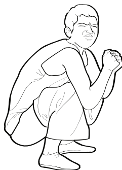
Kunanirwa kwituma ibikomeye cyangwa kwituma impatwe